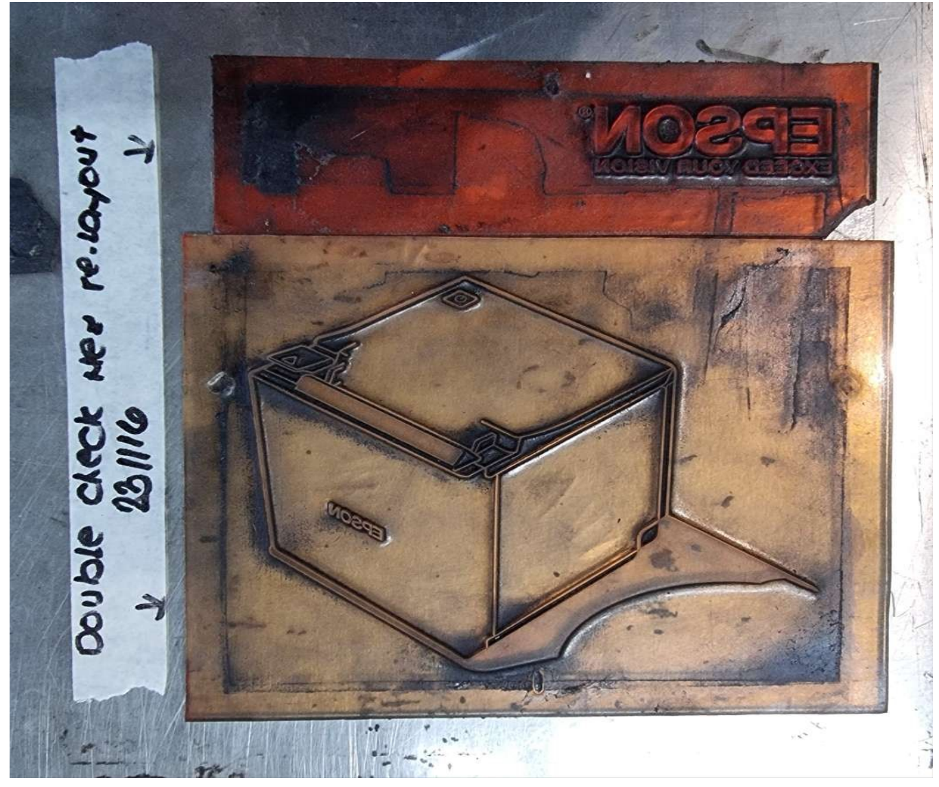
CYREL ALREADY CLEAN, RE-ADHESION & RE-LAYOUT